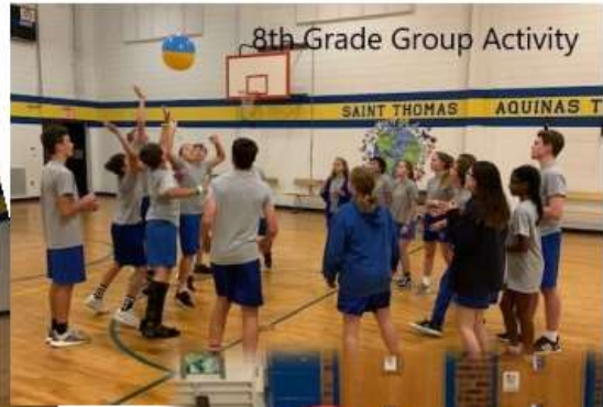
8th Grade Group Activity