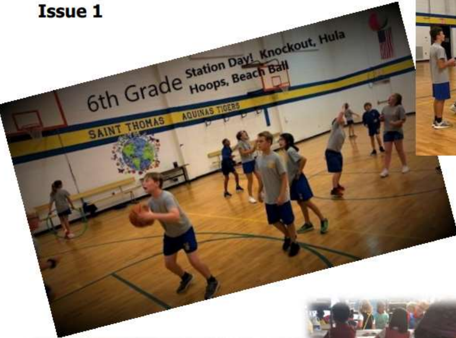
6th Grade Station Day! Knockout, Hula Hoops, Beach Ball